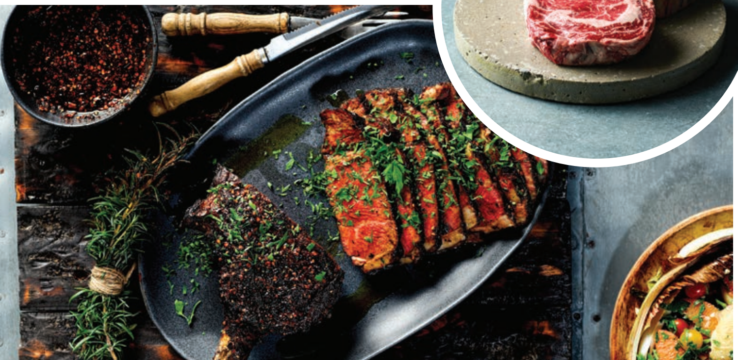
Main picture and insert: Angus Reserve Black Angus Beef